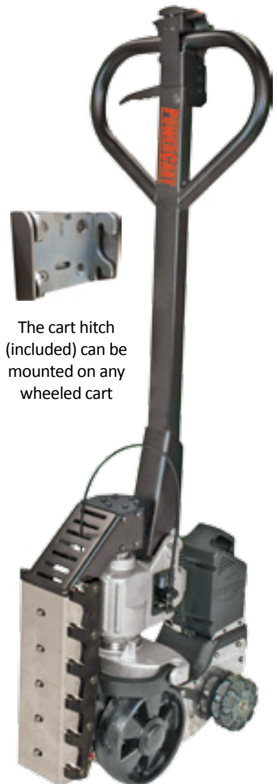
The cart hitch (included) can be mounted on any wheeled cart

SAFER TO USE: A unique feature of the PCH is its automatic pin locking system that ensures a secure connection between cart and mover. A spring-loaded pin locks the PCH's hitch to the cart's hitch preventing the two from separating - regardless of the terrain or use case. The locking pin is also automatically retracted when the cart is unhitched.