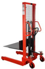
Fixed Platform Stacker