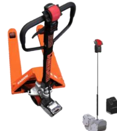
Power Pallet Drives