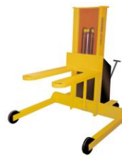
Ergo Work Positioner