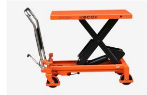
Manual Lift & Transport