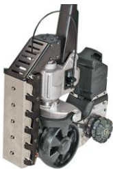
Power Cart Drives