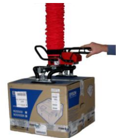
Vacuum Lift Systems

Contact our Application Specialist with your requirements and projects