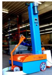
Robot Stretch Wrappers