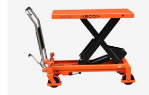
Manual Lift & Transport