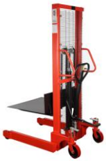
Fixed Platform Stacker