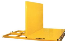
STATIONARY UPENDERS 1,000/2,000/4,000/6,000 LBS