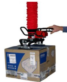
Vacuum Lift Systems

Contact our Application Specialist with your requirements and projects