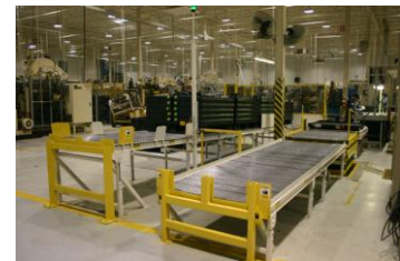
Dumpers & Upenders