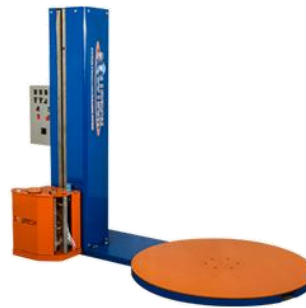
Stretch Wrappers Solutions