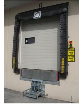
Loading Dock Equipment