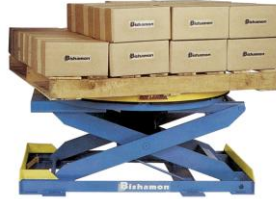
Automatic Pallet Positioner