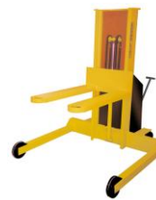
Ergo Work Positioner