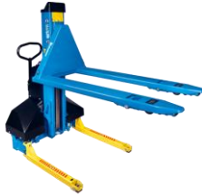
UniLift Pallet Handler