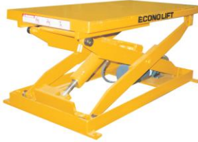
Lift Tables Engineered to Order