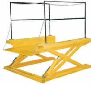
Drive-On Loading Docks