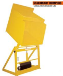
STATIONARY DUMPERS 1,000/2,000/4,000/6,000 LBS