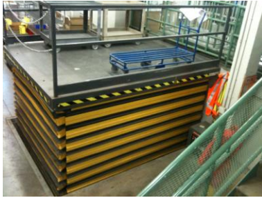
Elevating Dock Lifts