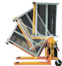
Tote Box Tilter