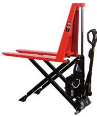
Electric/Manual Skid Lifters